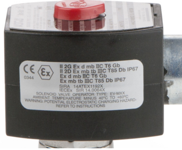
Figure 1: labels may have multiple T-codes to cover every realworld contingency.

If conditions at the facility where the valve will be used might qualify as this kind of special circumstance, consult the valve manufacturer before specifying a final purchase.